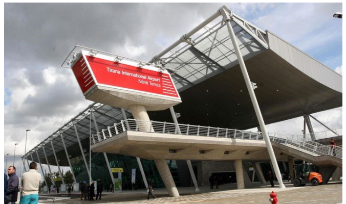
Airport “Mother Thereza” in Tirana.